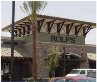
Village at Arrowhead